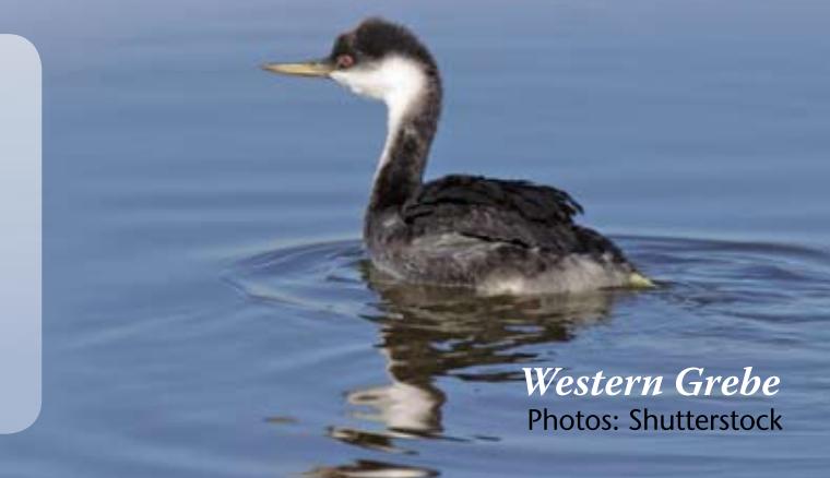
Western Grebe

Dunlins, Mallards, Northern Pintails, American Wigeons, Trumpeter Swans, Western Grebes, and Western Sandpipers are just some of the many species that depend on the rich habitats of Boundary Bay.